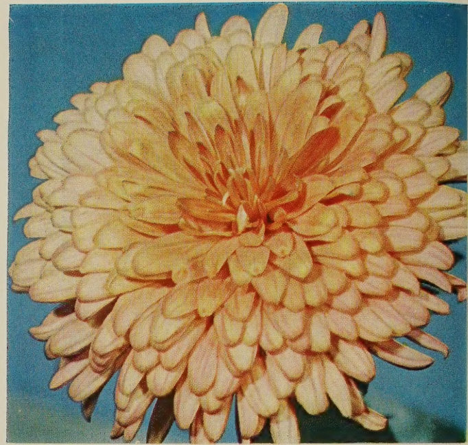
BEACON. 60c each; 3 for $1.50